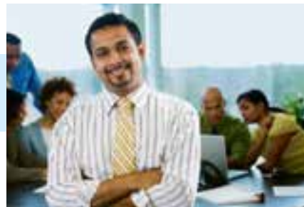
Brugg Cables Academy