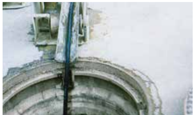
Fibre optic cables for installation in sewers, pressure tunnels, rivers, lakes etc.