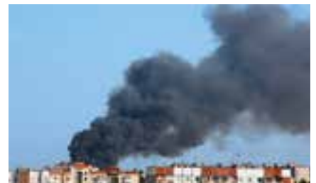
Fire prevention and safety