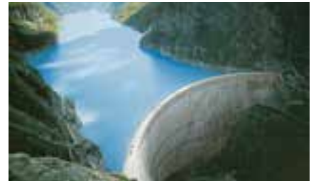
Environment and earth movements