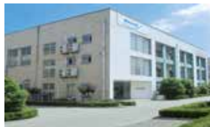
Brugg Cables China