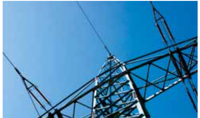
Optical ground wire