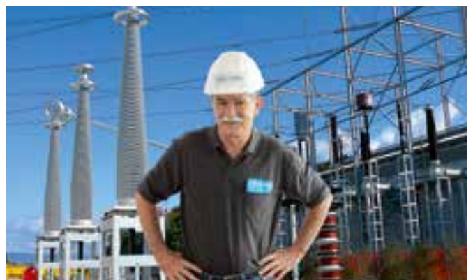
Service and support