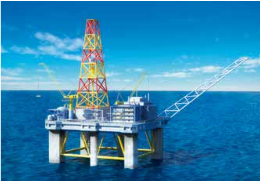
Energy and industry