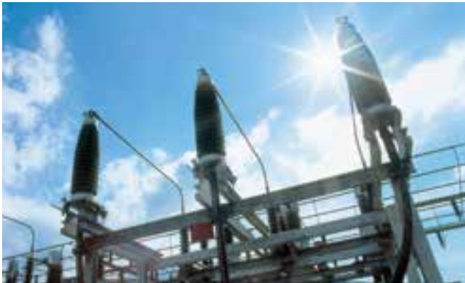
Substations, power plants and power transmission