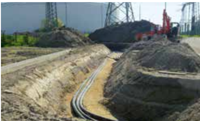
High voltage cable solutions