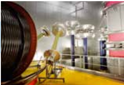
Testing and factory acceptance