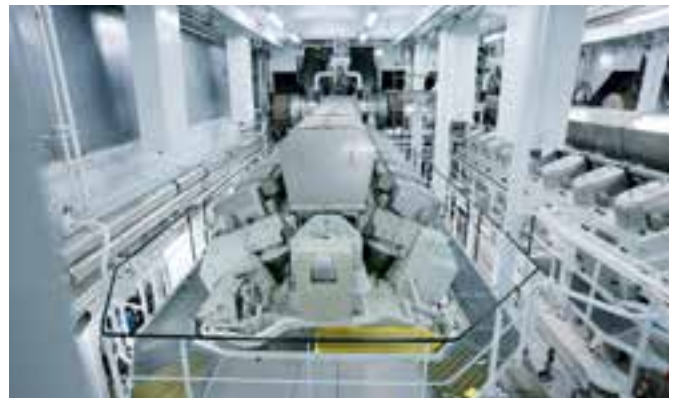
Plant and engine construction