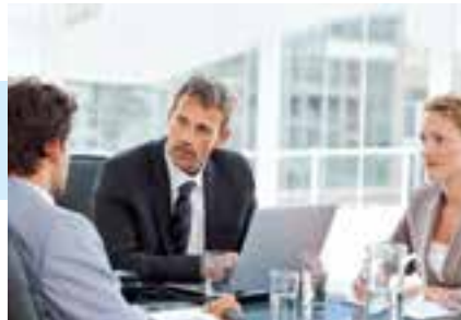
Consulting, project management and engineering