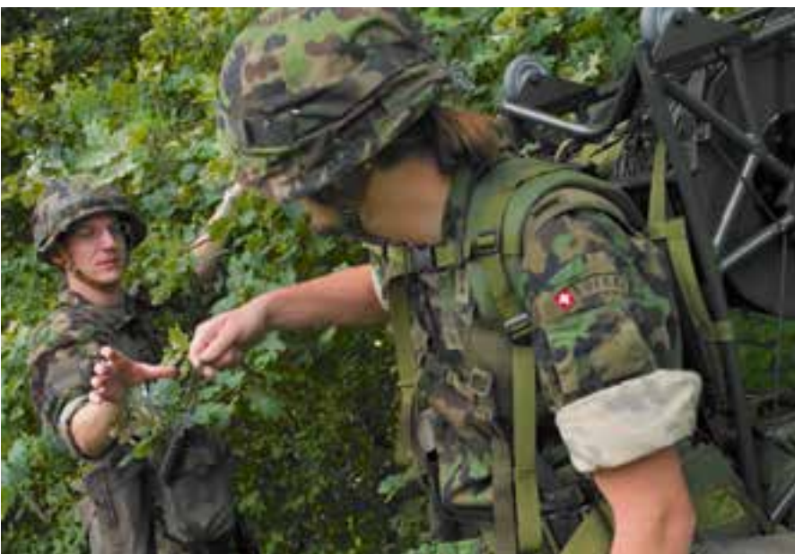
Military, police and disaster operations