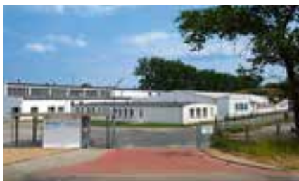
Brugg Cables Poland