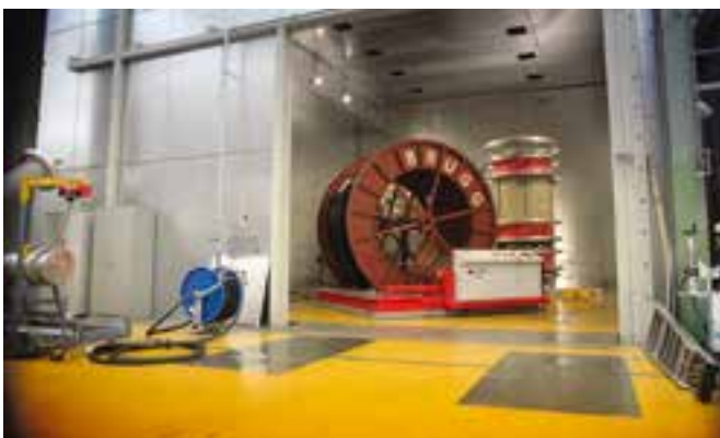
Testing and factory acceptance