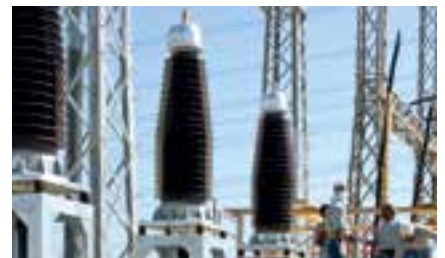
Terminations for polymer cables for outdoor use