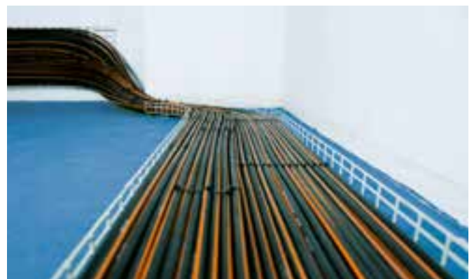
Fibre optic cables and accessories