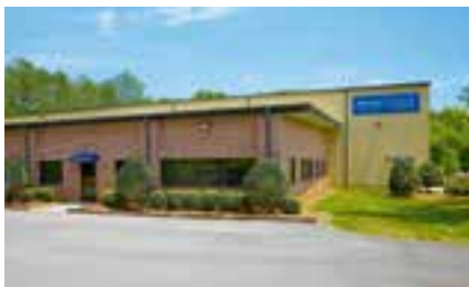
Brugg Cables USA