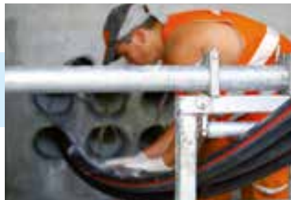
Installation, service and support