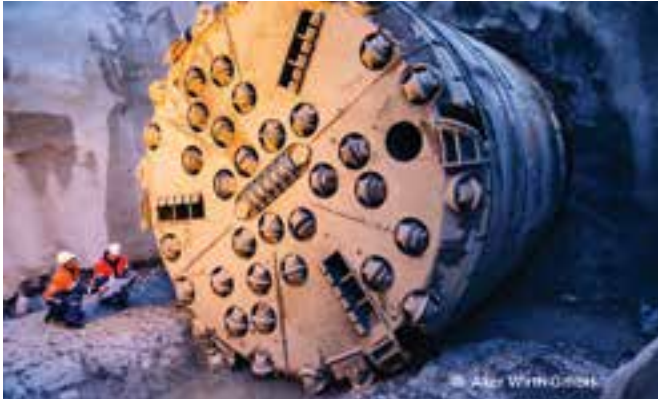
Heavy-duty construction machinery