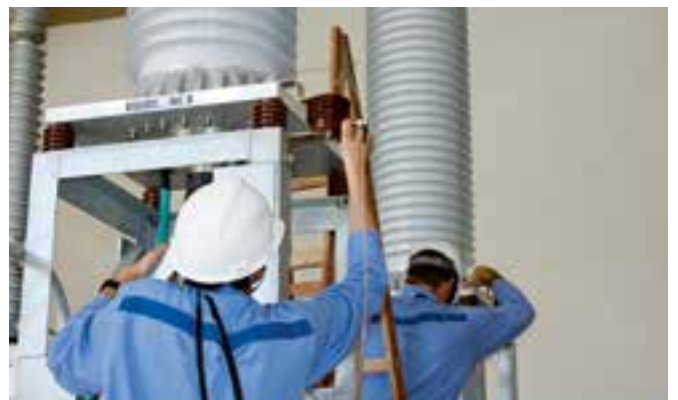
Installation and customer support