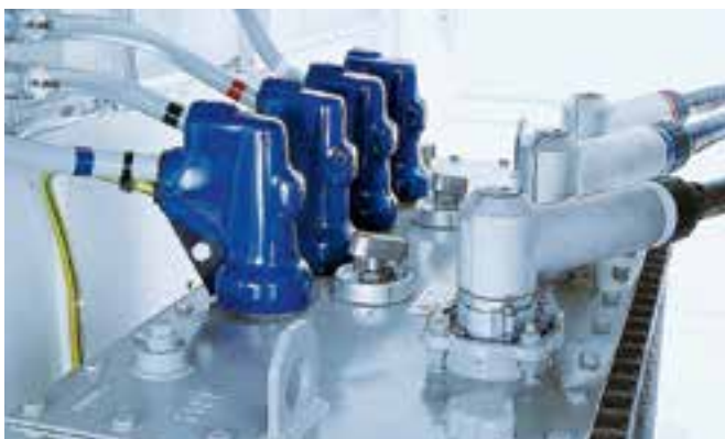
Low-voltage and medium-voltage accessories