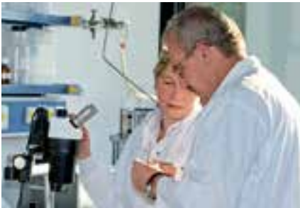
Research and development