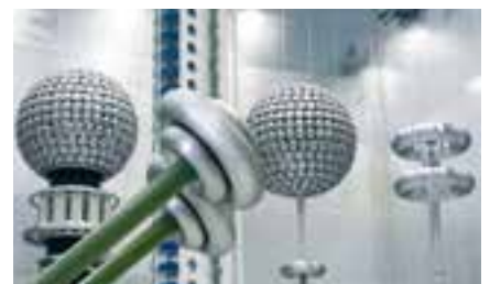
Development and testing services