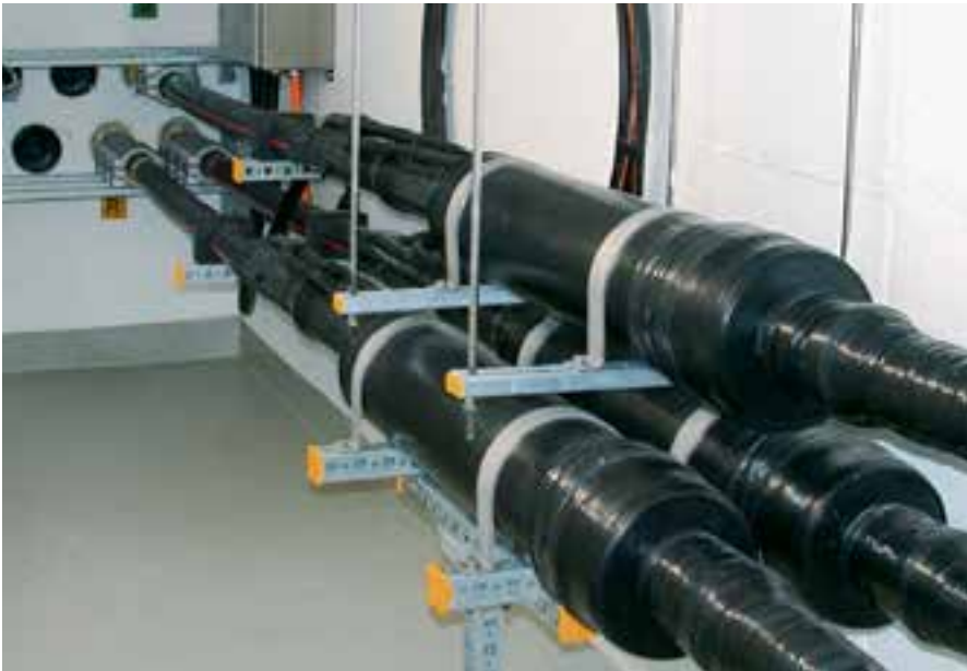
Joints for polymer cables