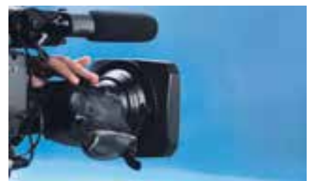
Television and film industry