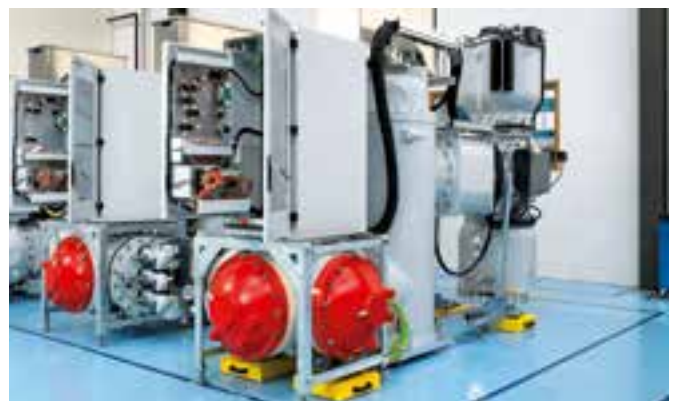
Providers for energy suppliers