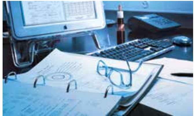
Engineering and project management