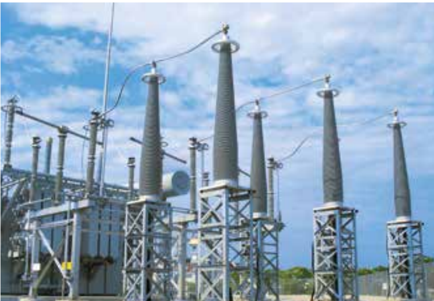
Terminations for polymer cables